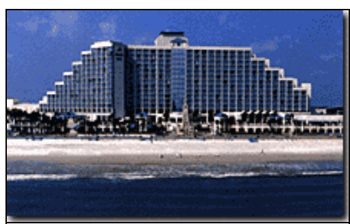
The Adam's Mark Daytona Beach Resort

Many new tools and exhibits that will demonstrate how you can enhance your Operational Con-