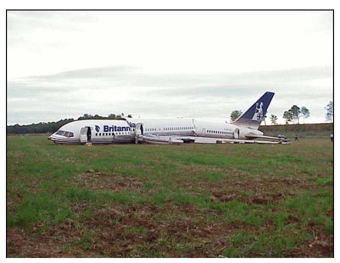
Britannia 757 lies in a field following the overrun accident. Unlike in the USA, British airlines do not use Dispatchers and the captain's authority is absolute.

in hospitals under observation. The pilot was unable to stop on the slippery runway and was reported to have made two passes before trying to land. An official at Britannia in London said it was too early to determine the causes of the accident. The airport director said conditions contributed to the accident but it was too early to know the exact cause. "We'll have to make a complex investigation, but with the weather conditions as they were at that moment, then possibly that's something to do with it," he said.